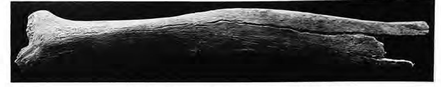
FIGURE 2 .- Well-remodelled fracture of right tibia, lower-chamber superficial collection.