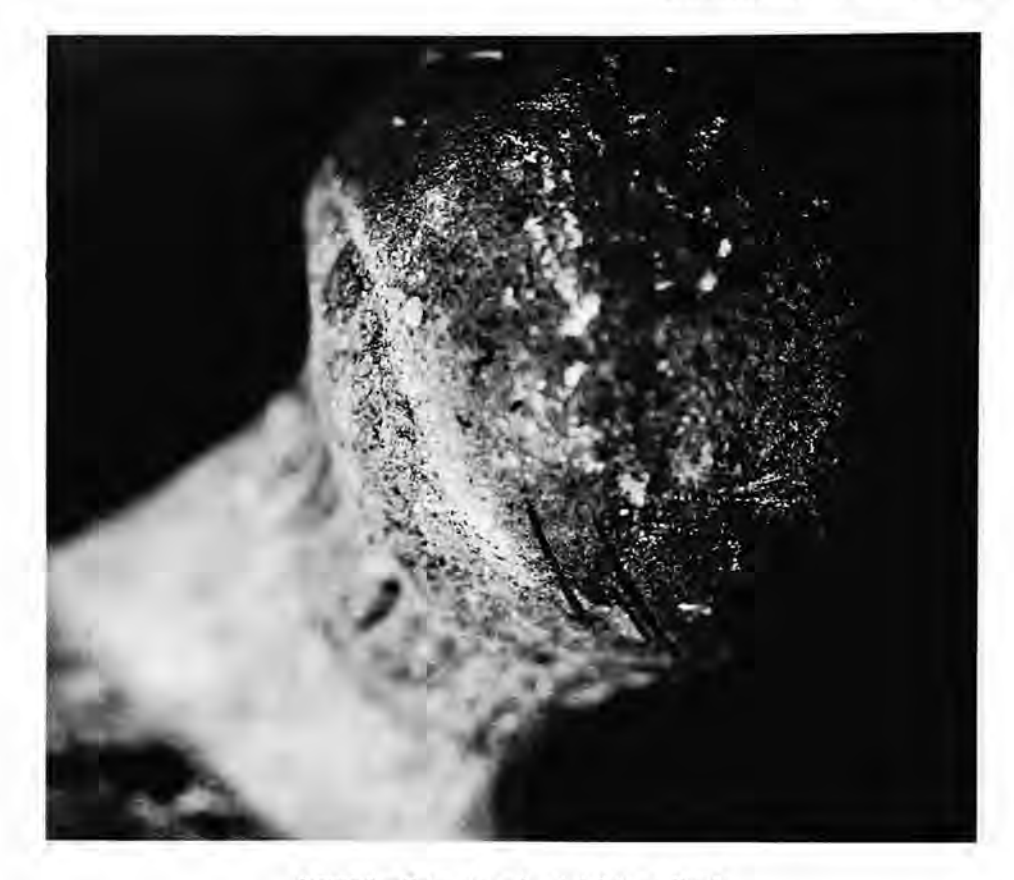
FIGURE 8 .- Cut marks on female left femur, Box 3.

the six teeth (maxillary left second molar) also has an associated alveolar abscess.