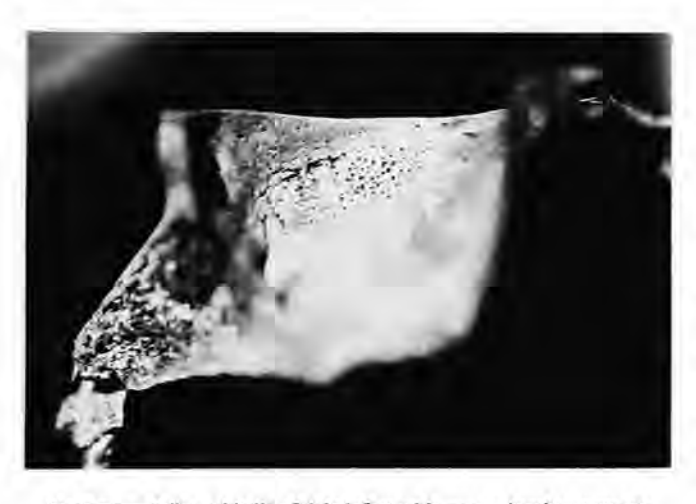
FIGURE 1 .- Cribra orbitalia of right infant orbit, upper-chamber strata cut.

Frontal orbital areas present are 29 left and 30 right. Five left orbits and three right orbits show the porosity in the upper orbital area known as cribra orbitalia (Figure 1). Two of the left orbits with this porosity also show evidence of porosity elsewhere on the frontal bone. As listed above, one of these frontal abnormalities appears to result from infection, and one reflects porotic hyperostosis likely due to anemia (porosity continuous with internal bone). The ratio of bones with evidence of porotic hyperostosis (9) to total number of individuals in the sample (74) is 0.12.