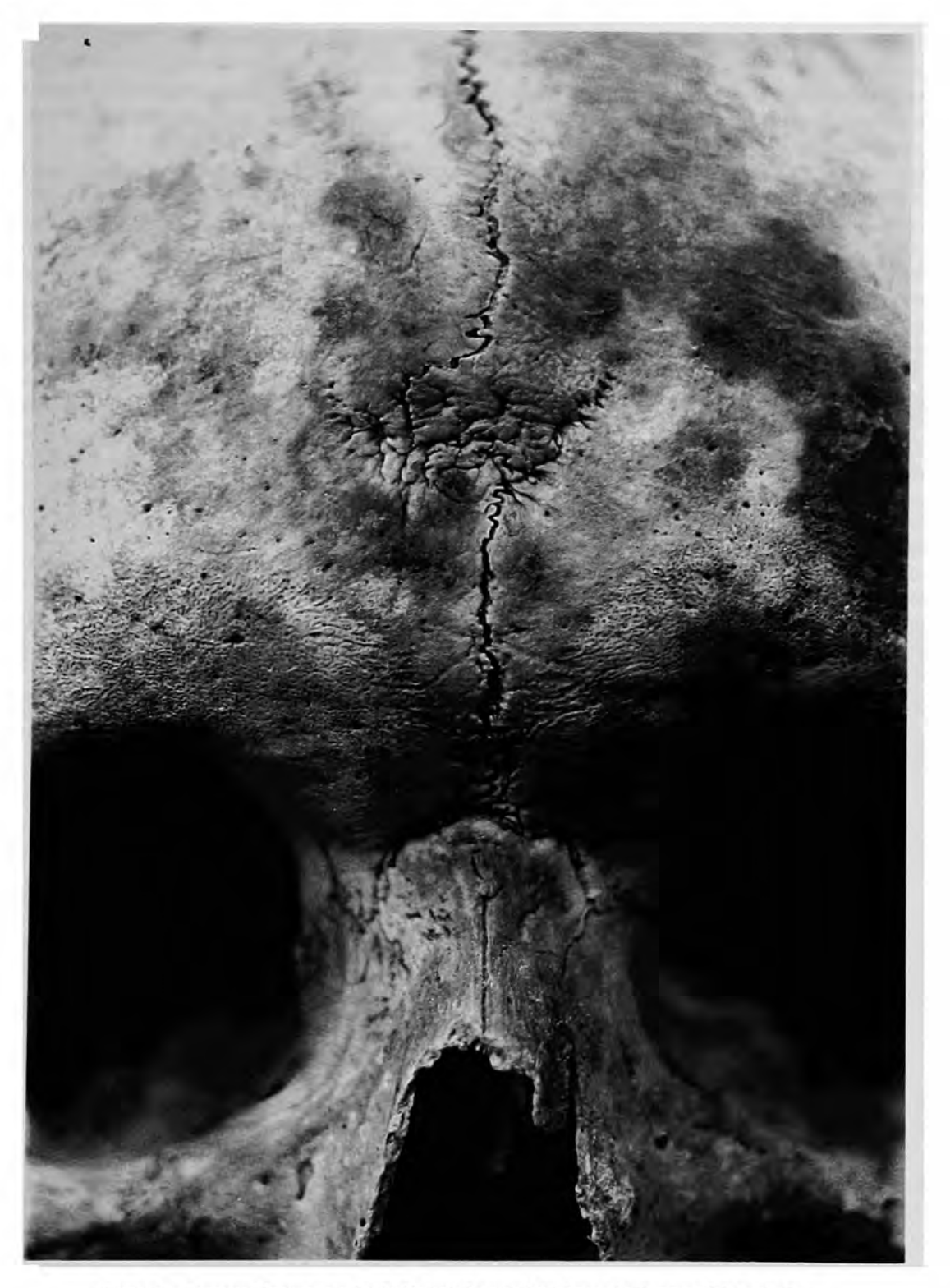
FIGURE 4.-Depressed fracture associated with metopic suture from lower-chamber superficial collection.

A left ulna shows well-remodelled reactive bone over most of the diaphyses, especially the proximal end.