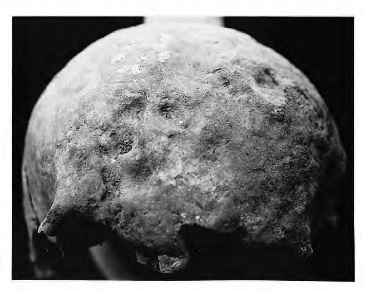
FIGURE 5.—Remodelled lesions on frontal and parietals of male from lower-chamber superficial collection.

The frontal and parietals of a 40- to 50-year-old male are very rough and abnormally thickened (Figure 5). The affected areas are well remodelled. A small, smooth-walled, crater-like depression 8 mm in diameter is present on the left parietal. An