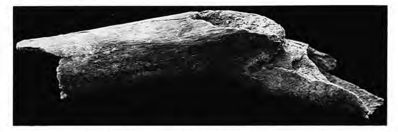
FIGURE 3.-Well-remodelled fracture of right tibia, lower-chamber superficial collection.

is of a left humerus. The fracture is located approximately 120 mm from the distal end. The humerus is missing its proximal end and measures only 180 mm in total length. Because of the fracture, the distal end is abnormally dislocated anteriorly.