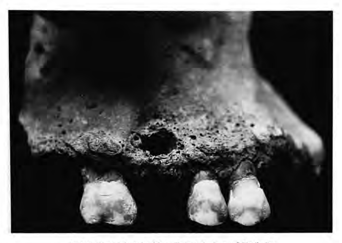
FIGURE 7.-Alveolar abscess in a right maxilla, lower-chamber superficial collection.