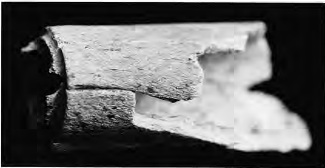
FIGURE 13.—Polished indentation of human femur, P-4, Cranium 2.

Also present with this feature is a 74 mm long segment, with a worked proximal end, from the left femoral cortex of a young adult. The modification consists of a polished indentation 3 mm deep and 3 mm wide that extends around the circumference of the bone (Figures 13, 14).