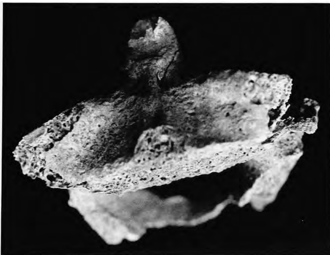
FIGURE 5.—Sheared surface of second cervical vertebra, P-1, Cranium 1, ventral surface.