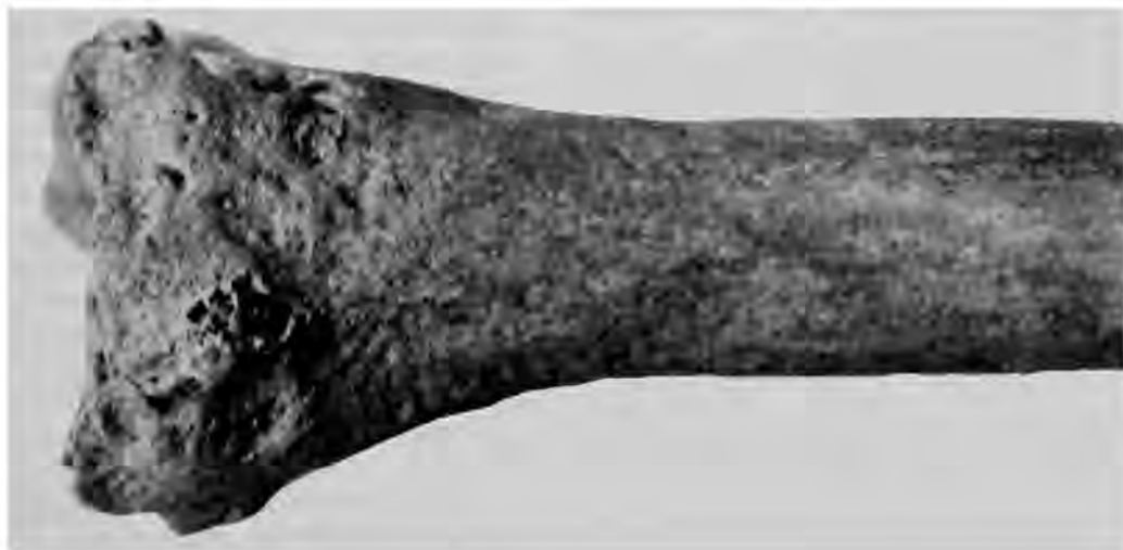
FIGURE 3.—Colles fracture of distal right radius of 20-year-old adult, sex undetermined, C-2, E-7.

The right radius shows a Colles fracture near the distal end, with considerable destruction of the distal articular surface (Figure 3). The right femur displays considerable platymery.