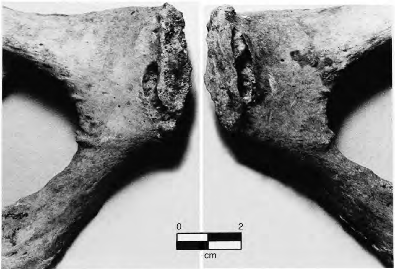
FIGURE 8.—Pubic bones of 45- to 50-year-old female, P-3, E-5, showing deep pitting.

Maxillary teeth present include the incisors, canines, first premolars, left second premolar, left first molar, and right second molar. Mandibular teeth present are the central incisors, right lateral incisor, premolars, and molars. The mandibular third molars are not erupted and have 33% root formation.