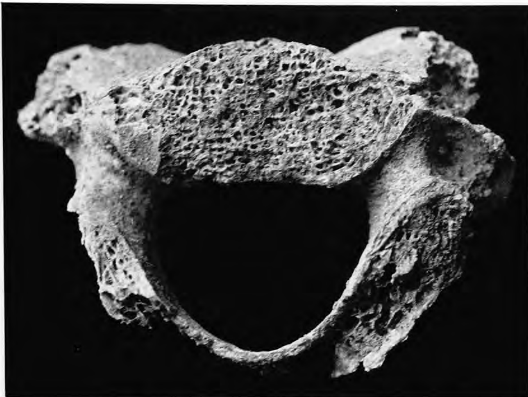
FIGURE 4.—Sheared surface of second cervical vertebra, P-1, Cranium 1, inferior surface.