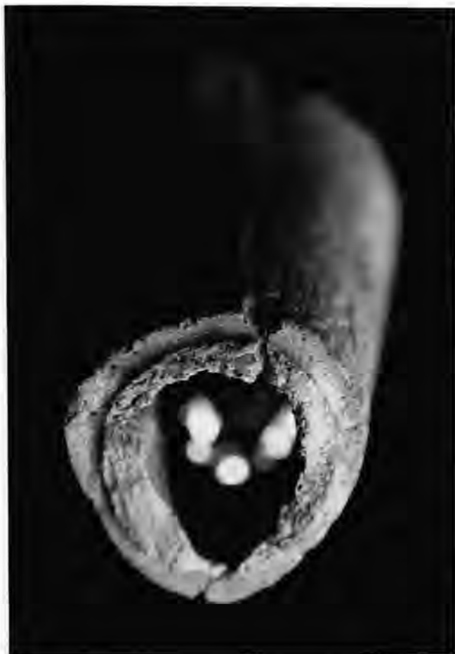
FIGURE 14.—Polished indentation of human femur, P-4, Cranium 2.

No reliable estimate of sex for this individual can be made. The extent of dental attrition suggests an age at death of between 21 and 24 years.