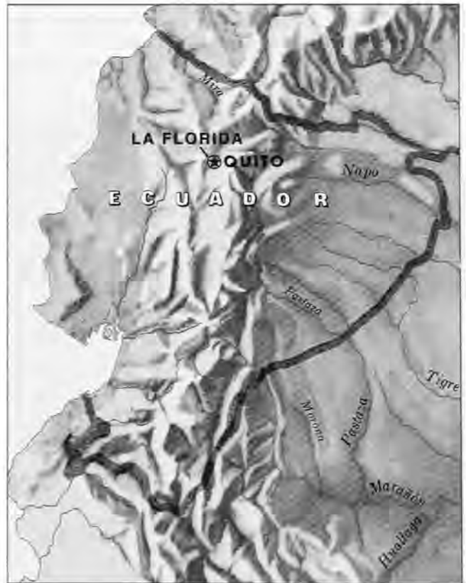
FIGURE 1.—Location of La Florida site, Ecuador.

mains recovered from the excavations. The analysis presented herein is largely limited to biological information gleaned from the recovered human remains. All archeological details, including mortuary analysis, interpretation of burial position, and procedure, will be reported separately by Doyon, supplementing published information (Doyon, 1988, 1995). Detailed skeletal inventories of each relevant unit are presented herein to facilitate future interpretations of this complex and ritually significant site.