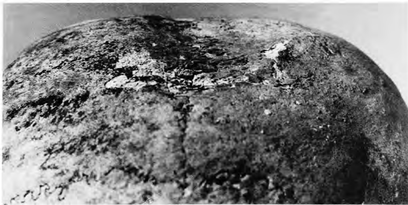
FIGURE 2.—Depression on posterior sagittal suture of 17- to 19-year-old female, C-1, E-2.

All cranial sutures are ununited. The following epiphyses were not united: proximal femur, greater trochanter of femur, iliac crest, proximal humerus, proximal ulna, distal radius, proximal radius, and proximal clavicle. The ilium and ischium were not united. The distal humerus was in the process of uniting. The roots of the third molars were about 50% complete. These data collectively suggest an age at death of about 15 years.