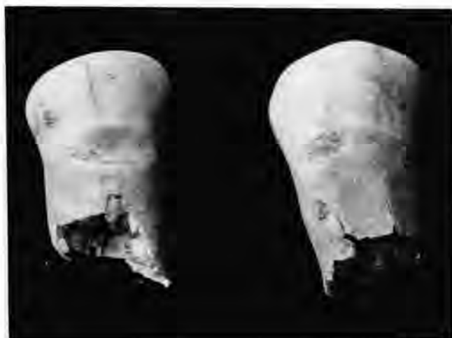
FIGURE 7.—Interproximal grooves on mandibular right first premolar (distal surface) and second premolar (mesial surface), P-1, Level 3.

16- to 19-year-old of undetermined sex (E-9), a 21- to 26-year-old of undetermined sex (E-9), a 20-year-old male (severed skull number 1), a 25- to 30-year-old male (severed skull number 2), and a mandible from a 25- to 30-year-old of undetermined sex (Level 3).