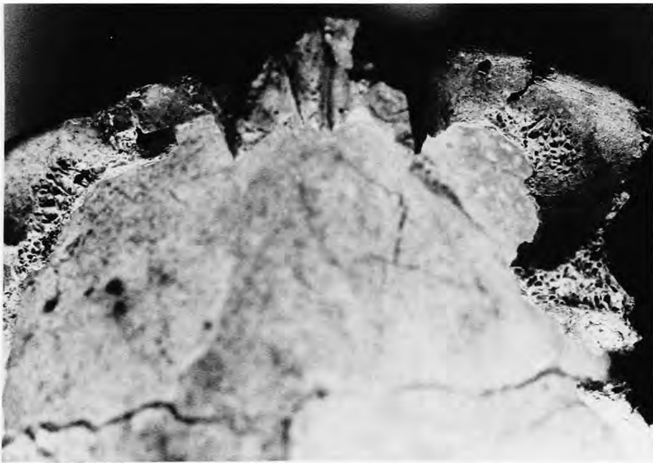
FIGURE 12.—Cribra orbitalia in both orbits of 18- to 19-year-old female, P-4, E1-D.

One hundred and ten teeth representing at least four adults are present. All but the following are present from three adults: two mandibular left central incisors, one mandibular left lateral incisor, one mandibular left canine, and one maxillary right first molar. A fourth individual is represented by all maxillary