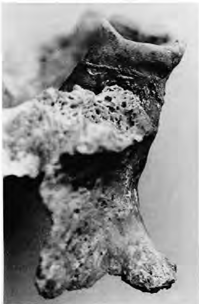
FIGURE 10.—Interproximal groove on the distal buccal surface of the maxillary first molar illustrated in Figure 9, P-3, E-5.

um suggest male sex. The extent of cranial suture closure and dental attrition suggests an age at death of between 22 and 25 years. No evidence of disease was noted. All teeth except the mandibular left second molar are present.