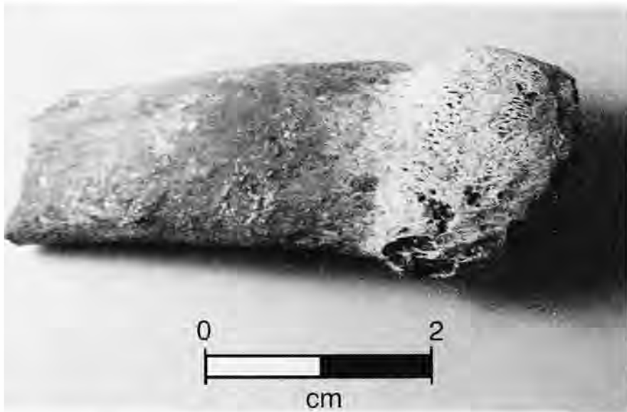
FIGURE 11.—Healed fracture on sternal end of right rib, P-4, E-1B.

An age at death of between 18 and 19 years is suggested by the extent of epiphyseal union and by dental formation, although slight occlusal wear on the third molars indicates that those teeth had already erupted.