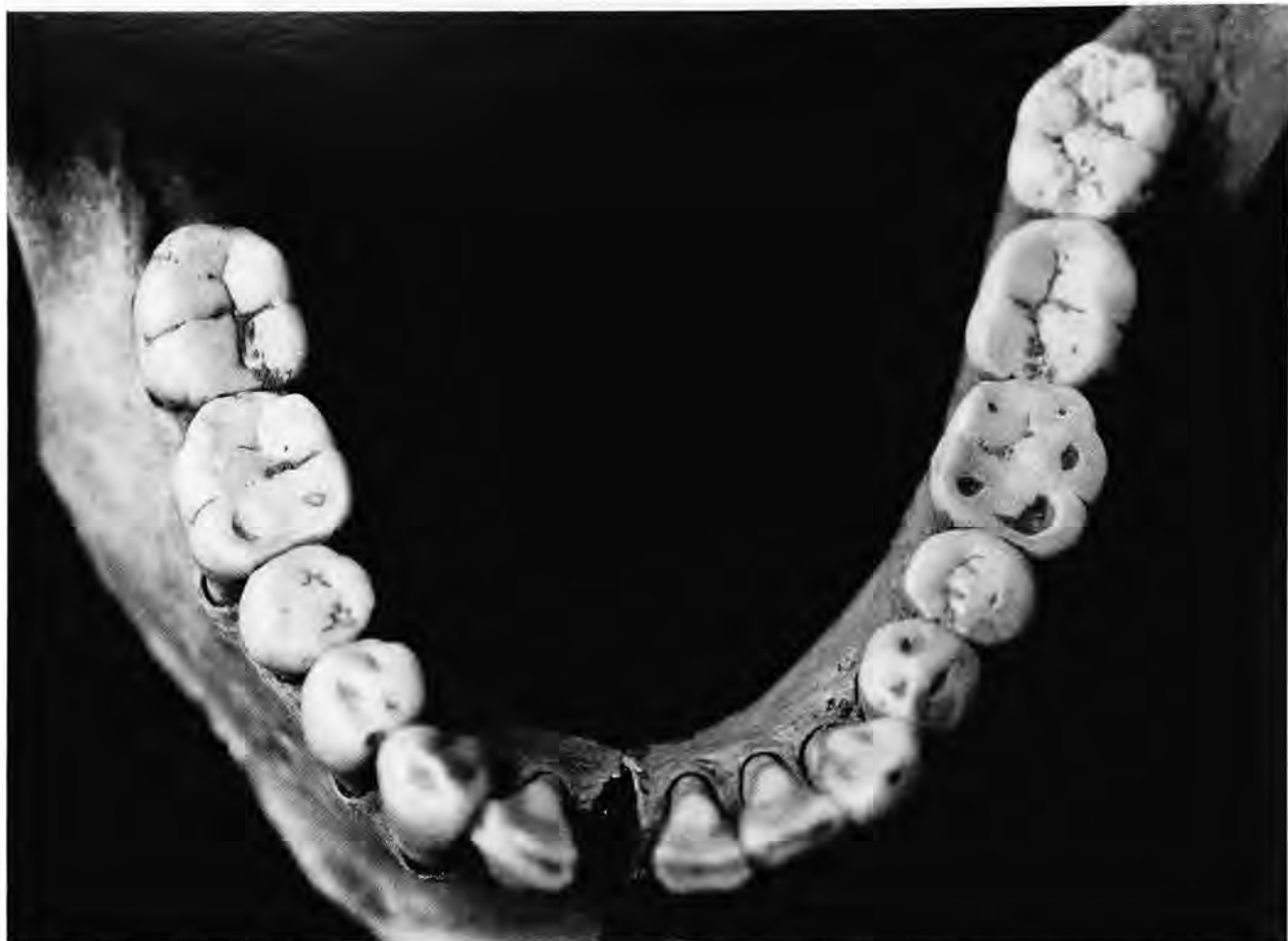
FIGURE 6.—Occlusal surfaces of mandibular teeth, P-1, Cranium 2.

the lower margin. Some reactive bone is present at the superior surface. The depression measures 7 mm × 13 mm × 3 mm deep. The lesion is smooth-walled and opens internally.